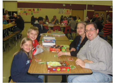
Photos from past Game Nights